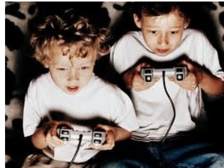
to be keen ___ something