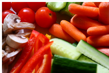
Vegetables are good ___ you.