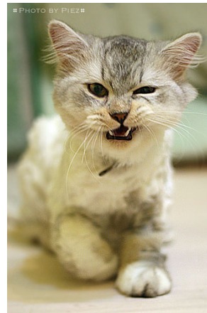
to be angry ___ sb ___ sth