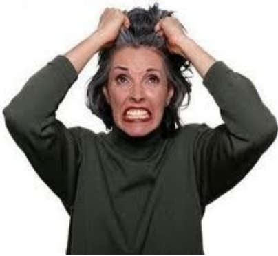
to be fed up ___ something