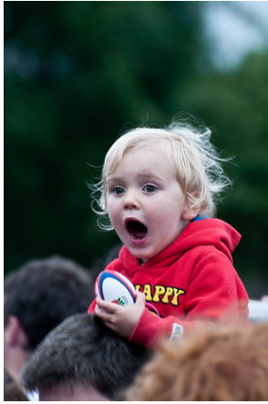
to be excited ___ something