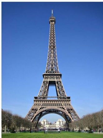
to arrive ___ a city or country