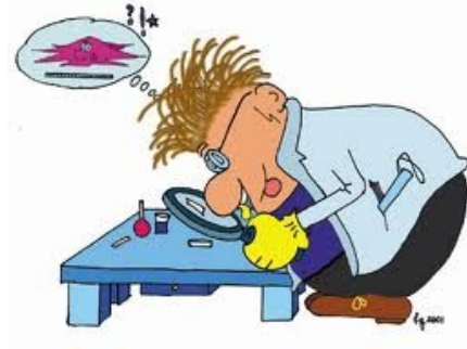
to be interested ___ a subject