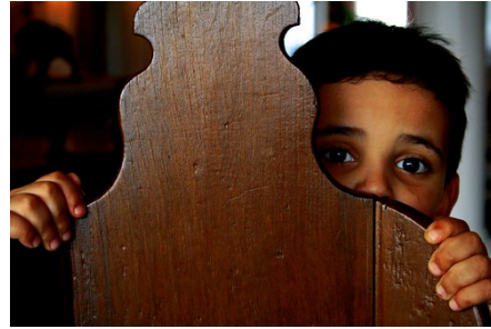
to be afraid ___ spiders