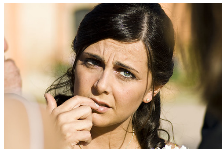
to worry ___ something