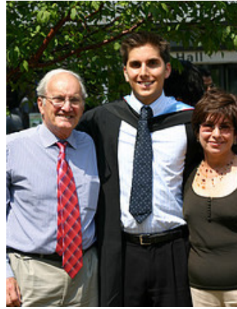
to be proud ___ something