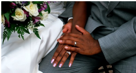
to be married ___ somebody