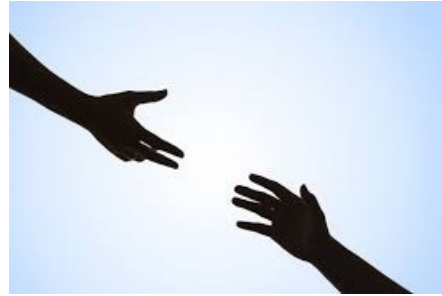
to ask ___ help