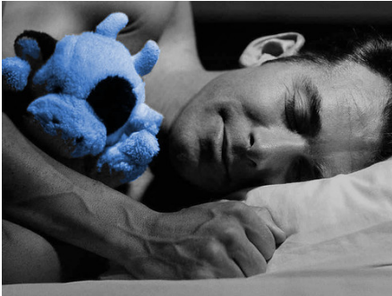
to dream ___ the future