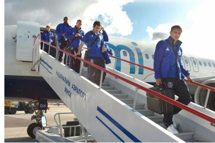
to arrive ___ the airport or cinema or party