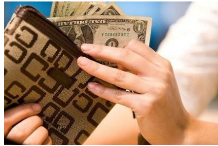
to spend money ___ clothes