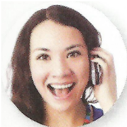
to be pleased ___ something