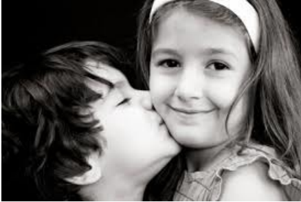
be fond ___ somebody