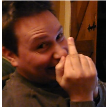
to be rude ___ somebody