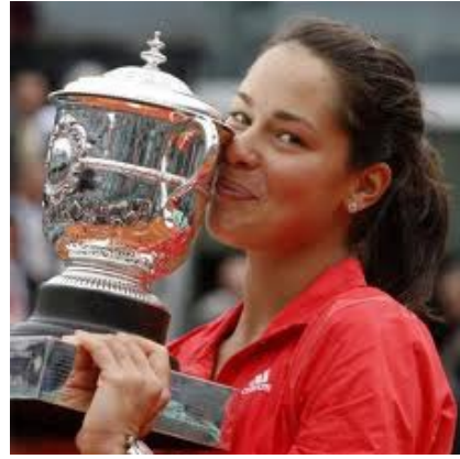
to be good ___ something