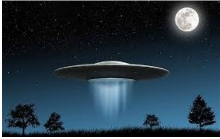
to believe ___ God