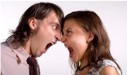
to argue ___ sb ___ sth