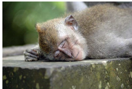
to be tired ___ something