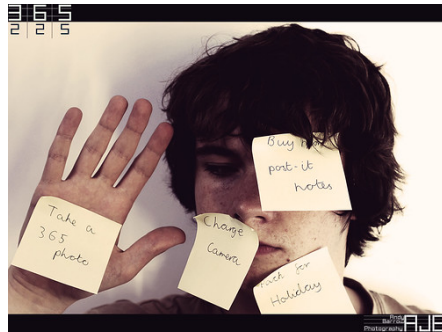
to remind me ___ something