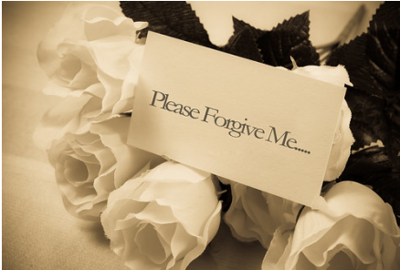
to apologise ___ sb ___ sth