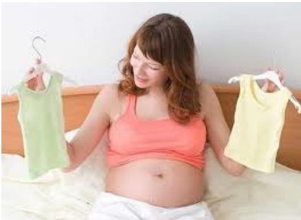
to look forward ___ doing something