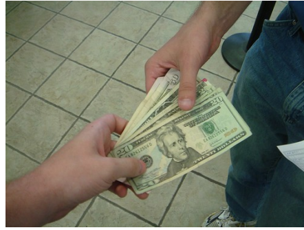
to pay ___ dinner