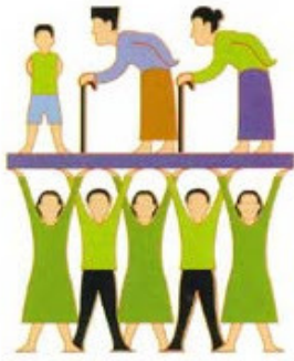
to depend ___ your friends