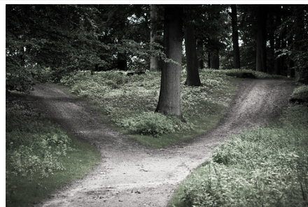
to choose ___ A or B