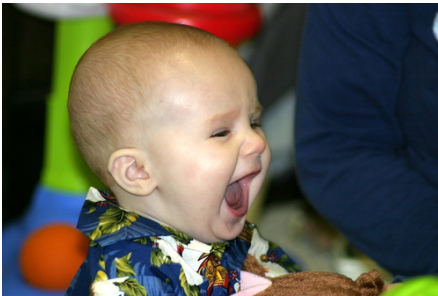
to laugh ___ a joke