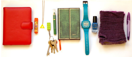
to belong ___ somebody